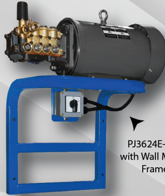
PJ3624E-WM with Wall Mount Frame

Our electric driven cold water units are used for multiple applications for farm, car and truck washing, meat shops and every day uses.