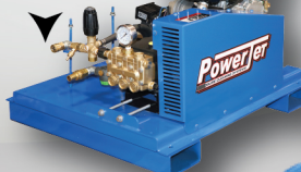
PJC14032D Stationary and Forklift Slot Option (Add-ST)